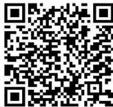
2025 Sponsorship Form

Our 2025 Sponsorship form can be found on our Swim Team page found on the LSC website under Activities and Groups. (hover over this QR code with your mobile camera to be directed to our sponsorship form)