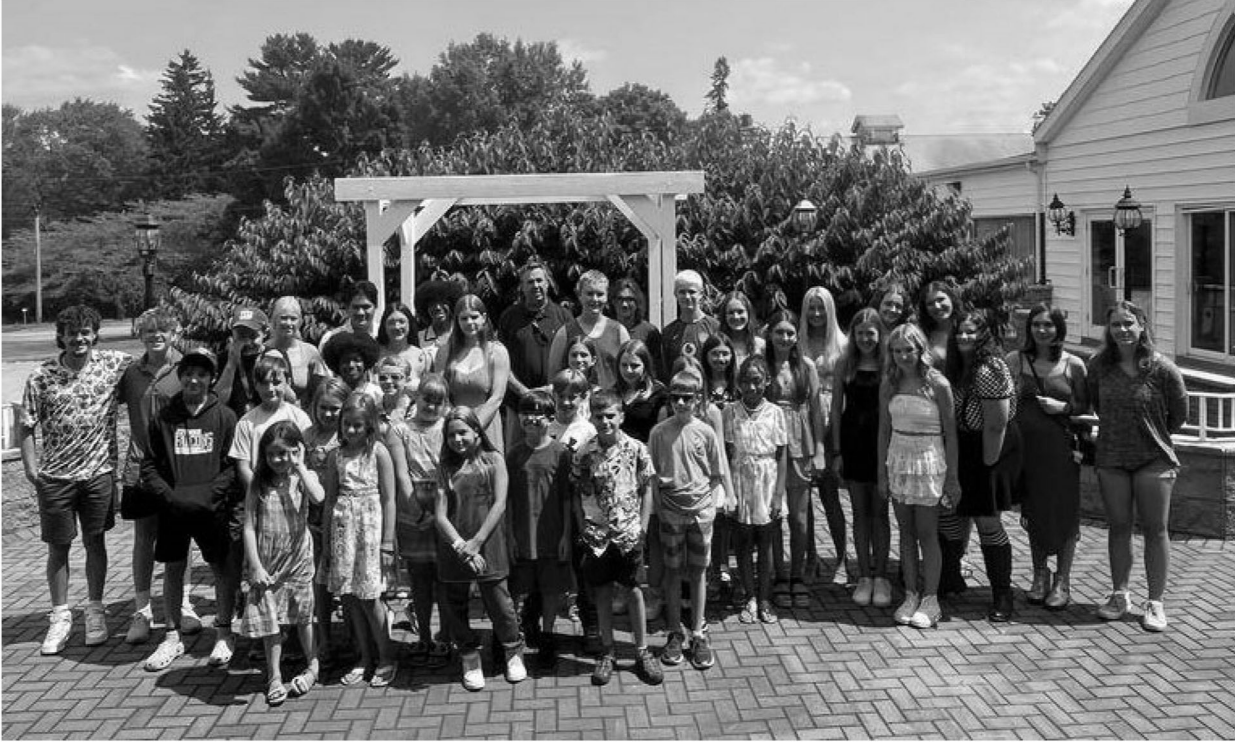
2024 Tribe - LSC Swim team